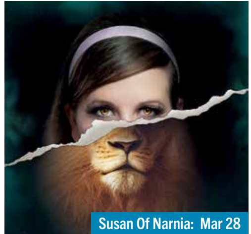
Susan Of Narnia: Mar 28