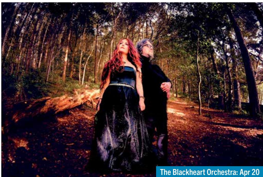
The Blackheart Orchestra: Apr 20