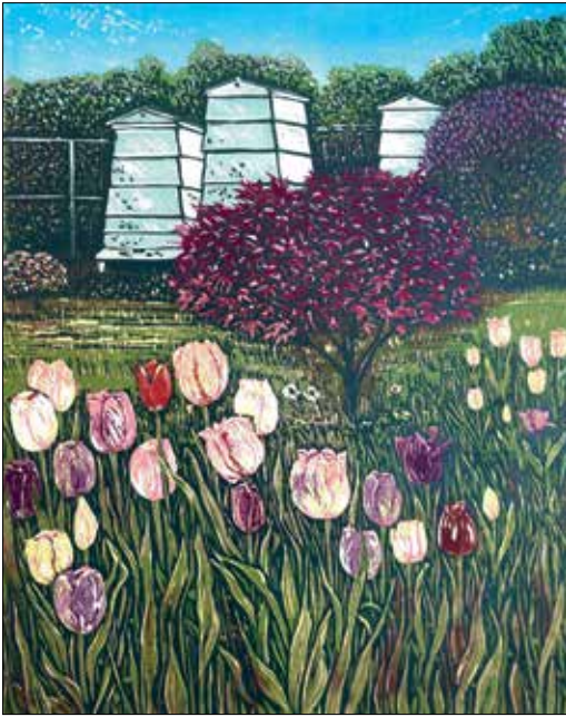
Above: Garden Apiary and Tulips