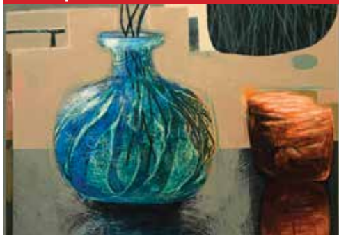
Tom Wood / p9