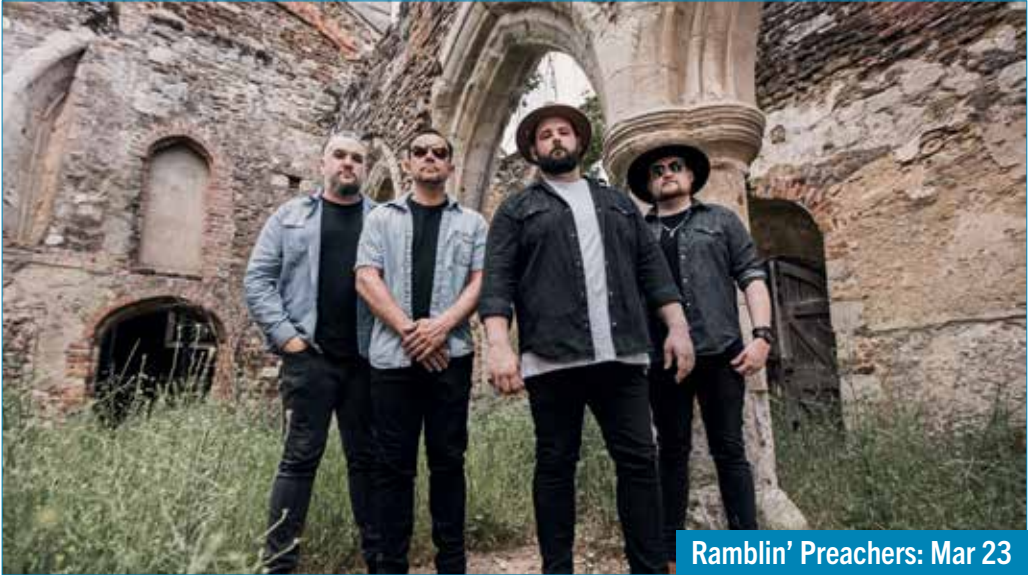
Ramblin' Preachers: Mar 23

especially in a small venue with a good sound system! Audiences must get fed up of performers praising the sound and volunteers at Ropery Hall shows but we have to admit they are right! We do our best to make the experience special and there's no doubt about it, live music in an intimate setting really is exceptional. We have a real variety of styles for you to try this season, so go on try something new. I bet you'll like it!