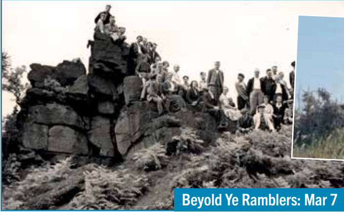
Beyond Ye Ramblers: Mar 7