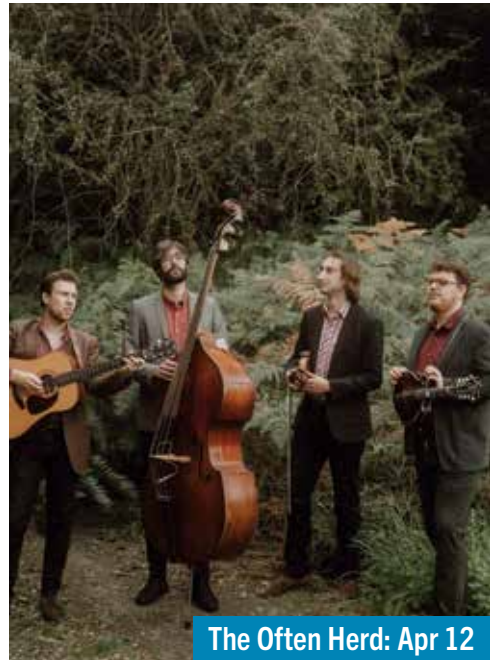
The Often Herd: Apr 12