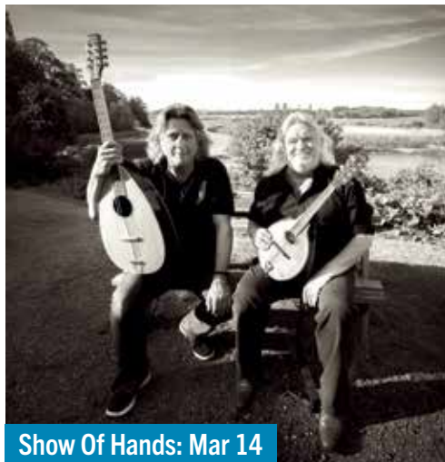
Show Of Hands: Mar 14