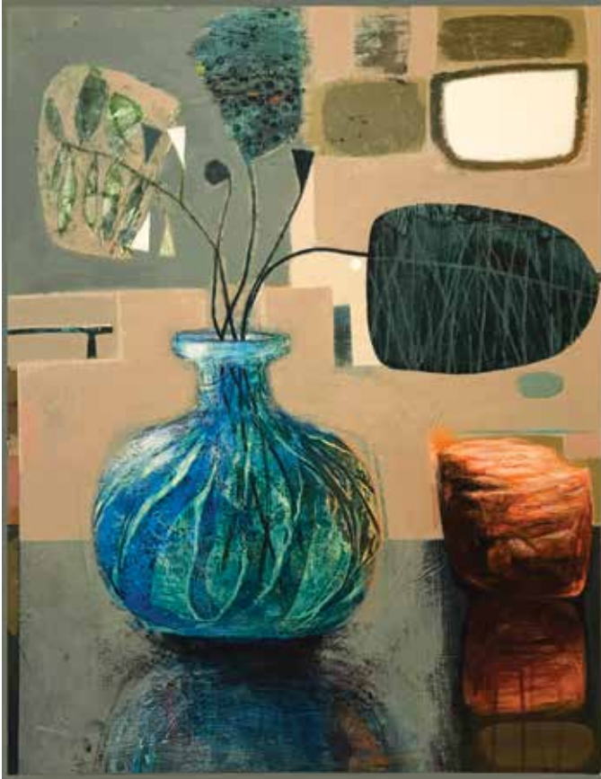
Above: The Brick That Broke My Window