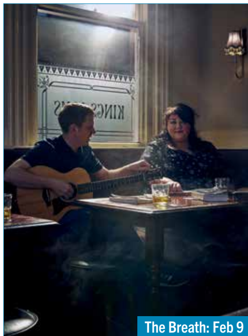
The Breath: Feb 9